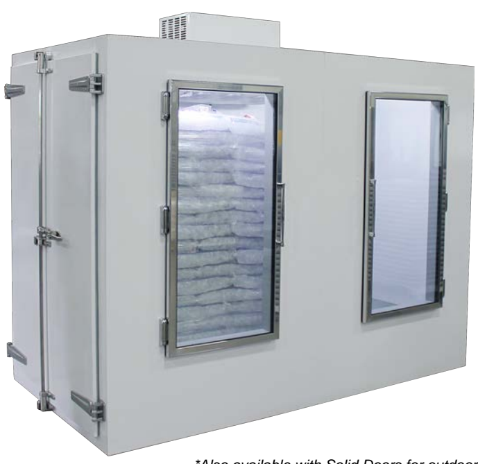
*Also available with Solid Doors for outdoor applications